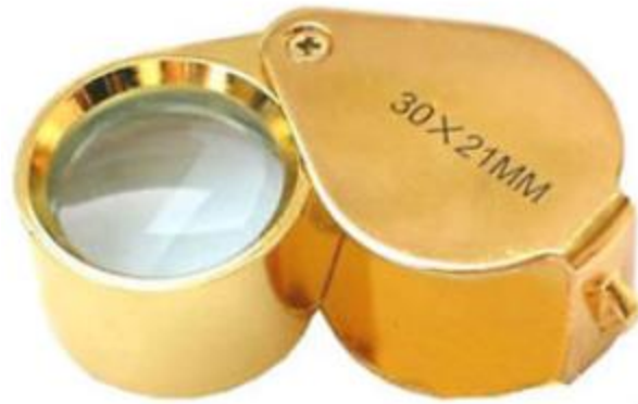
14k Gold Hastings Triplet Hand Lens