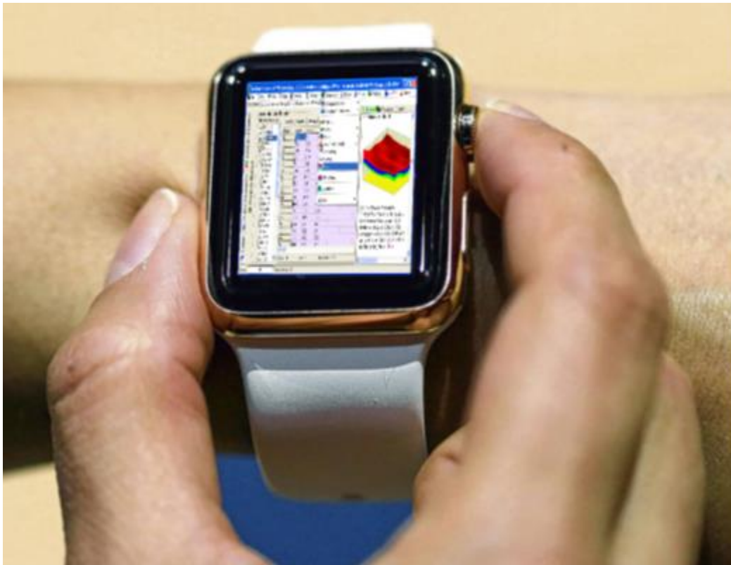
RockWorks Borehole Manager screen as viewed on the new iWatch.

The new RockWorks/iWatch product also includes a 14k gold Hastings Triplet 30x21mm hand lens to extend the user experience level by virtually eliminating data entry errors when entering borehole data into the program.