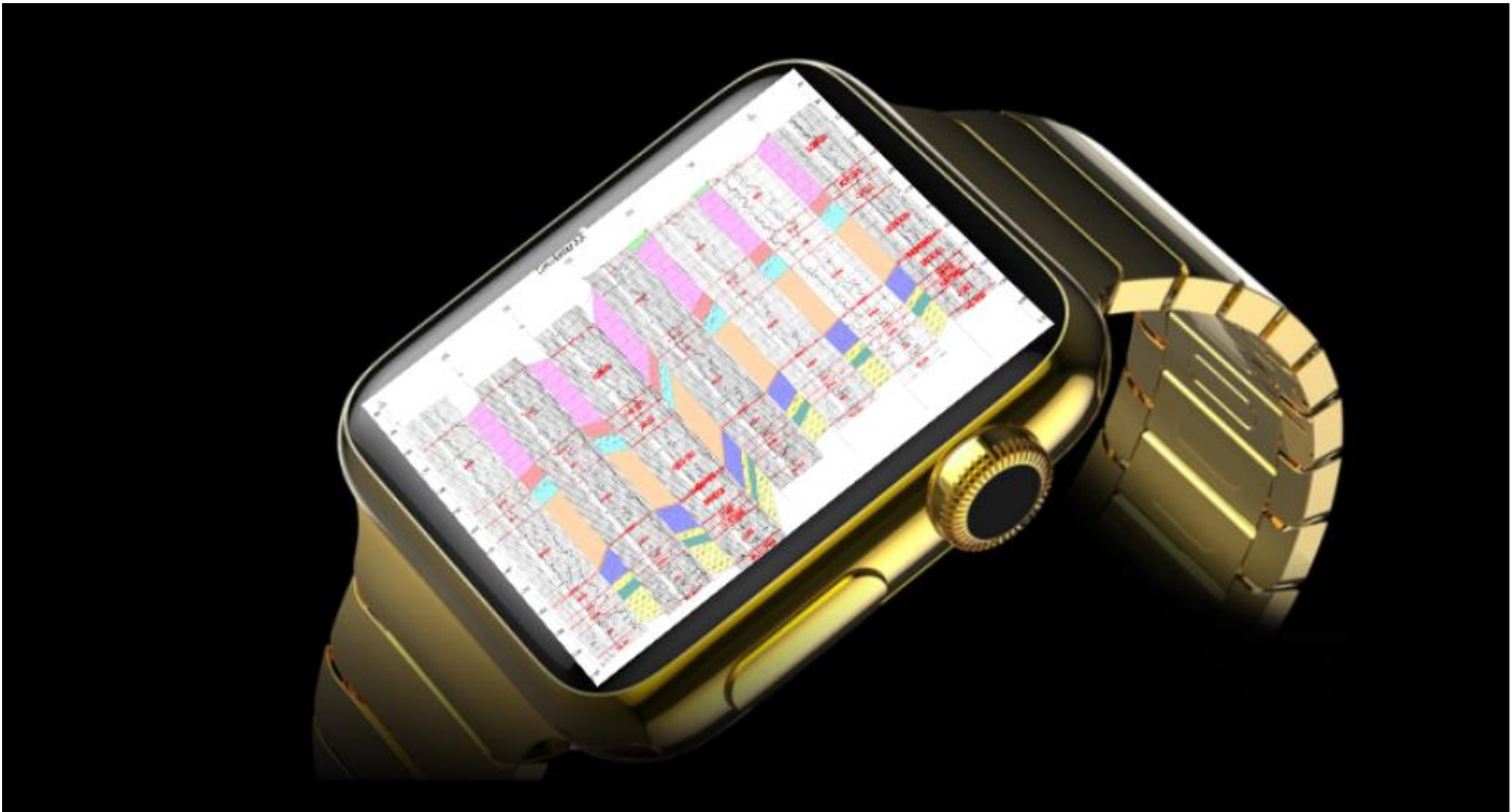
Easily correlate raster electric logs directly on your wrist!

All of the features within the Windows version of RockWorks16/Level-5 are included within this release; Geological Data Management (MDB or SQL Server Borehole Database), Modeling (2D Gridding & 3D Block Modeling), Analysis (e.g. Volumetrics & Pit Optimization), 2D/3D Visualization (e.g. Strip-Logs, Cross-Sections, Fence Diagrams), and Video Production (e.g. Plume Migration).